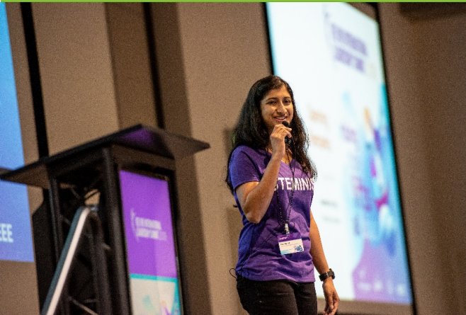
Photo from IEEE Women in Engineering International Leadership Summit